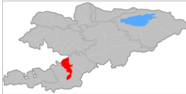
Figure 2. Location of Kara-Suu district

the permanent population was 476,200 people (27,200 urban and 449,000 rural). The average population density is 131.7 people per km 2 . The district occupies the Osh-Kara-Suu oasis, the northern spurs of the Alay Range, and part of the adyr zone of the Kichik-Alay Range. The elevations of the oasis range from 800 to 1,200 m. The relief of the district in the northern part is flat (22%), which is replaced in the southern direction by the adyr zone (20%), with the middle mountain and high mountain zones located above. Mountainous and foothill zones occupy 78% of the district's territory, and 22% is flat land. The climate of the district depends on the altitude, with hot summers in the flat and foothill parts of the district and moderately cold winters. The average annual air temperature is 12.1°C. Precipitation is irregular and amounts to 300-500 mm. The warm season lasts 200-225 days.